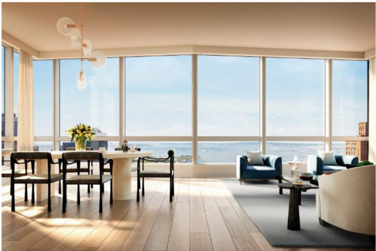
Residences boast oak flooring and floor-to-ceiling picture windows. BINYAN STUDIOS

Boutique residences will begin at the 15th floor, boasting 360-degree vistas of the New York Harbor, Hudson River, Statue of Liberty and Verrazano Bridge as the glass façade ascends—a sleek contrast to its skyscraper neighbors. Sales recently launched for a collection of residences, ranging from $1.78 million to $3.5 million, as announced by New York-based Trinity Place Holdings Inc. Future residences and penthouses are likely to cost more.