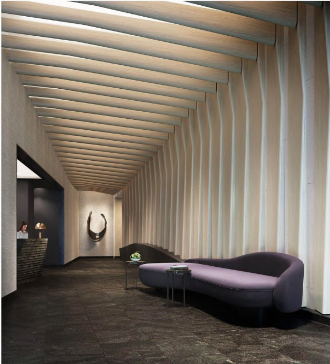
Double-height grand lobby with sculptural oak paneling and blackened-steel concierge desk.

“Our work at 77 Greenwich is exacting but warm,” says Stephen Brockman, a partner at Deborah Berke Partners. “Its modern design elevates the rituals of daily life with rich, highly tactile materials and thoughtful layouts that reflect the best of contemporary living.”