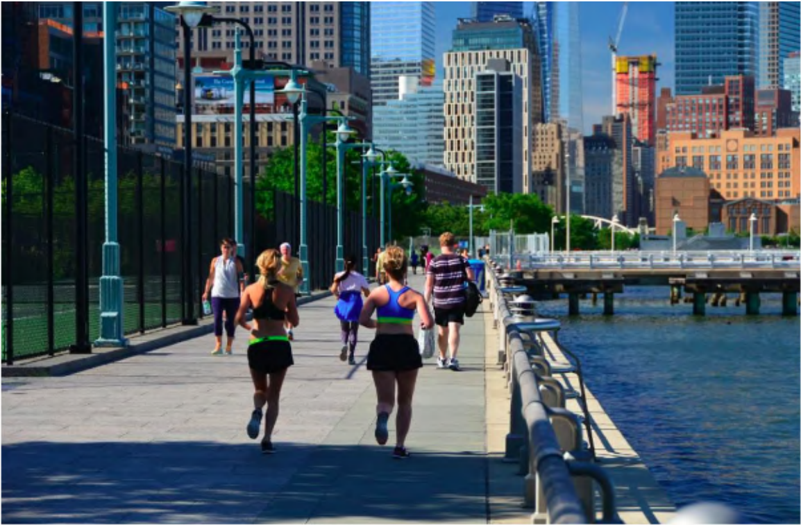
The condominium will be conveniently located near the Hudson River and the Battery Park City Promenade.