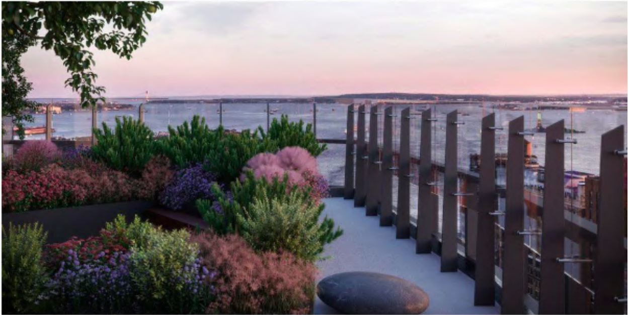
Outdoor spaces include a 3,600-square-foot rooftop garden and Zen meditation deck. BINYAN STUDIOS

The 41st floor amenities open to 950 square feet of outdoor space with a Japanese rock garden. A lower, 2,350-square-foot terrace includes pergolas and a dog run. The new 20,000-square foot Elizabeth H. Berger Park will offer 77 Greenwich residents even more outdoor options.