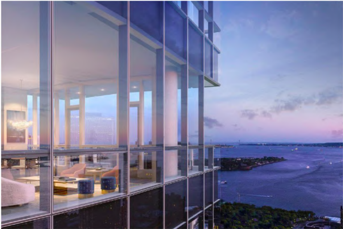
The 42-story glass tower offers sweeping Hudson River views.

Designed by firm FXCollaborative (architectural firm behind the recently opened Statue of Liberty Museum) and Deborah Berke Partners (designer of 432 Park Avenue), the Greenwich Street residential building features a pleated, reflective glass façade rising from a cast stone base—a historic nod to the neighborhood's masonry architectural landscape.