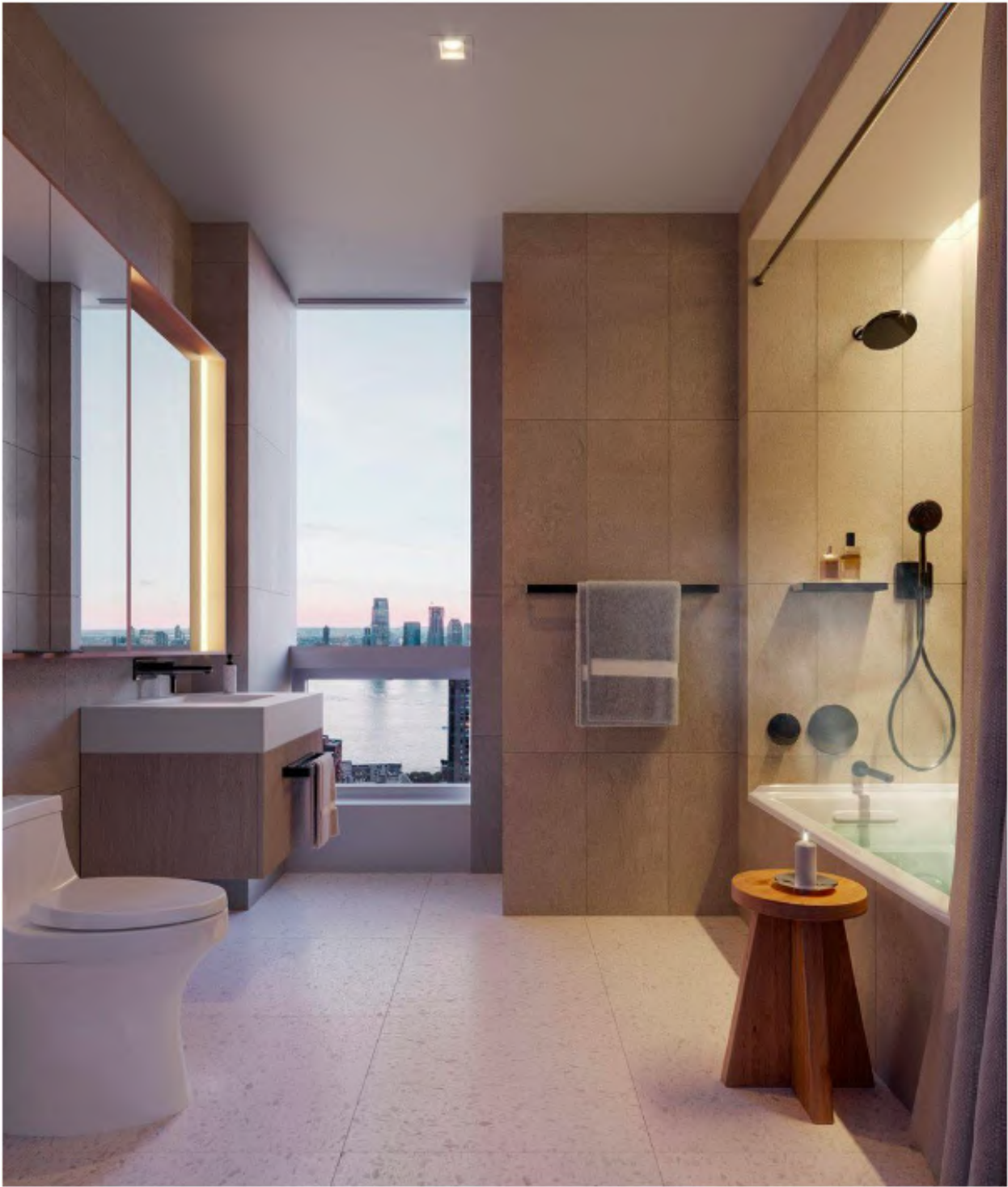
Secondary bathroom with Venice terrazzo tile floor BINYAN STUDIOS

Master bathrooms will have warm gray Haisa marble (radiant-heated) floors, walls and counters, and sycamore millwork. Secondary bathrooms will be outfitted with Venice terrazzo tile floors, oak millwork cabinets while powder rooms are designed with polished Calacatta Lincoln sink bowls, backsplash panels, and brushed Bianco Mist quartzite floors.