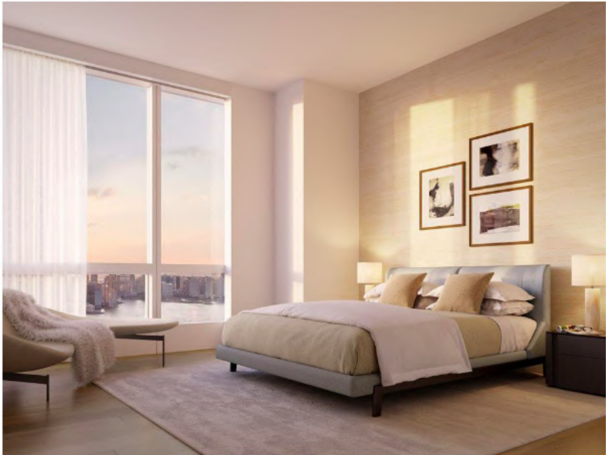
Bedrooms range from $1.78 million to $3.5 million, not counting penthouse pricing.

Each natural-light-flooded residence will include white oak flooring, powder rooms, 10-foot-plus ceiling heights, and floor-to-ceiling windows casting unobstructed water and skyline views. The homes will feature Poliform kitchens, high-end appliances (Miele, Sub-Zero, Wolf) and striking Blue de Savoie marble countertops and backsplashes.