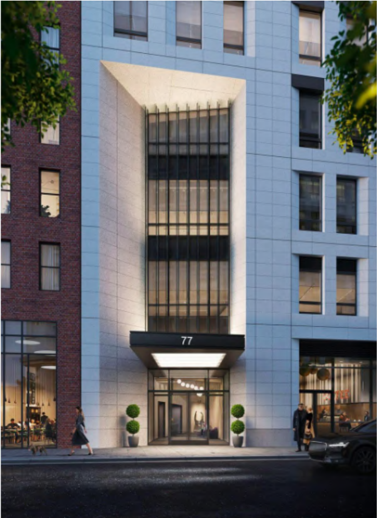
77 Greenwich will sit in the heart of downtown Manhattan.