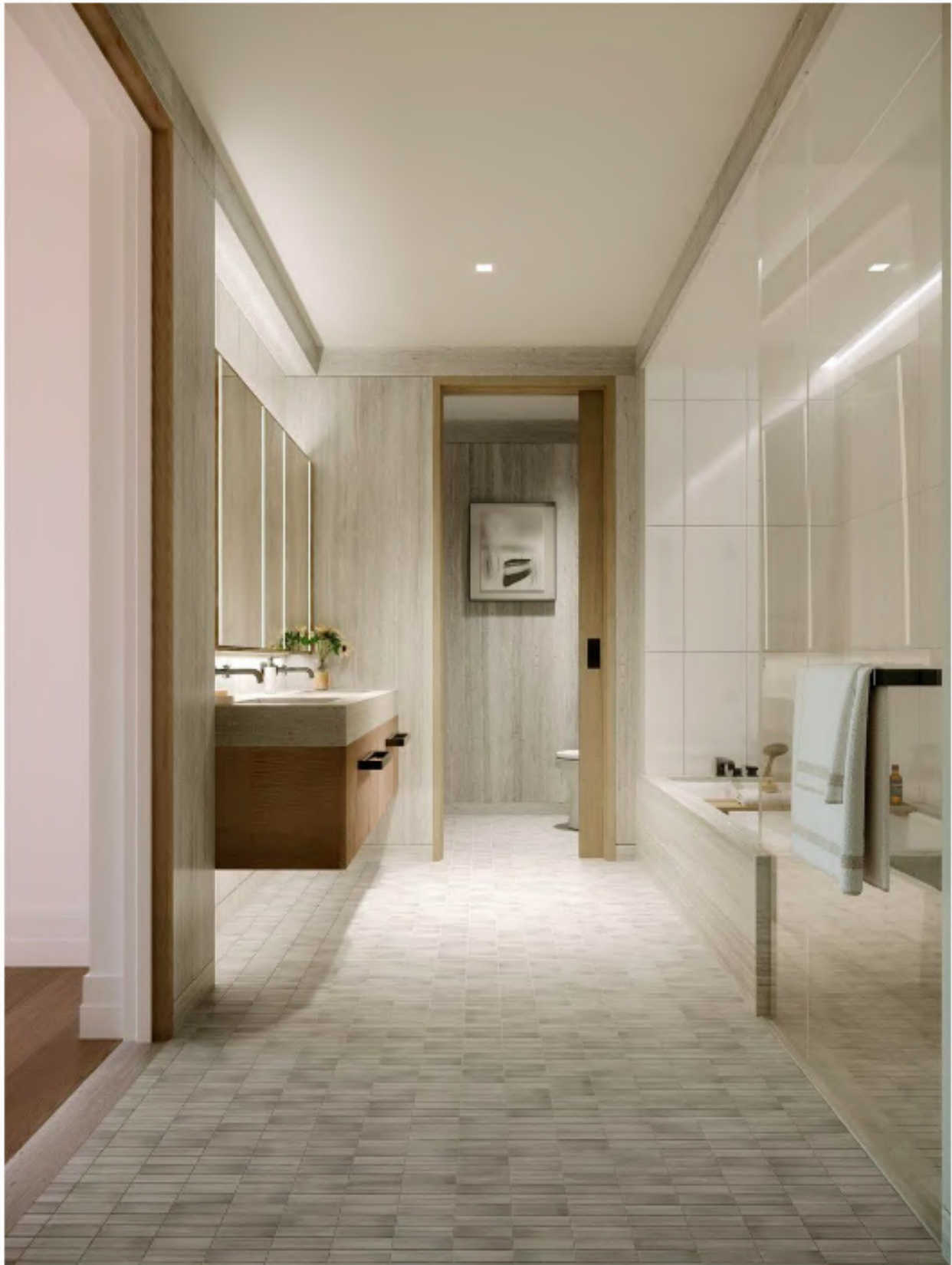
Master bathrooms will feature sycamore millwork and radiant-heated floors. BINYAN STUDIOS