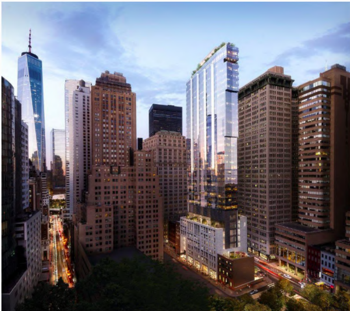
77 Greenwich has a pleated, reflective glass wall façade design. BINYAN STUDIOS

Writer, pop culture virtuoso and luxury lunatic