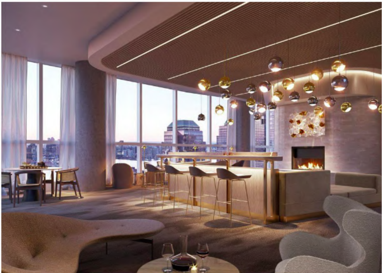
Fireplace lounge