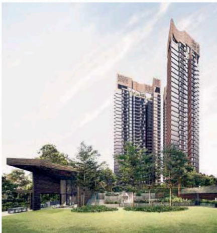
GuocoLand development's Martin Modern in Singapore will have a leash-free area for dogs.

What you can buy from S$1.990m+: A 764 sq ft, two-bedroom unit at Martin Modern – GuocoLand's two-tower development in New York's prime District 9 near the hip Robertson Quay, shopping street Orchard Road and the CBD. Four-bedroom units of 1,733 sq ft are priced from S$4,630,000. Pets and humans will love the botanical setting, rooftop gardens and leash-free dog run.