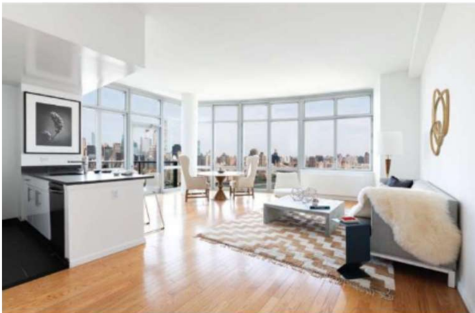
(Top) Incredible views at 77 Greenwich in the Financial District. (Above) A spacious layout at 45-45 Center Boulevard in Long Island City.